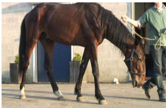
A horse with Botulism walking slowly with a short stride & head down

It is important to note that the whole gastro-intestinal tract may be affected by the flaccid paralysis. Therefore choking or colic due to impaction are also seen in association with botulism. All those signs may progress to general flaccid paralysis. In the worst cases, the horse may not be able to stand and usually dies from an inability to breath.